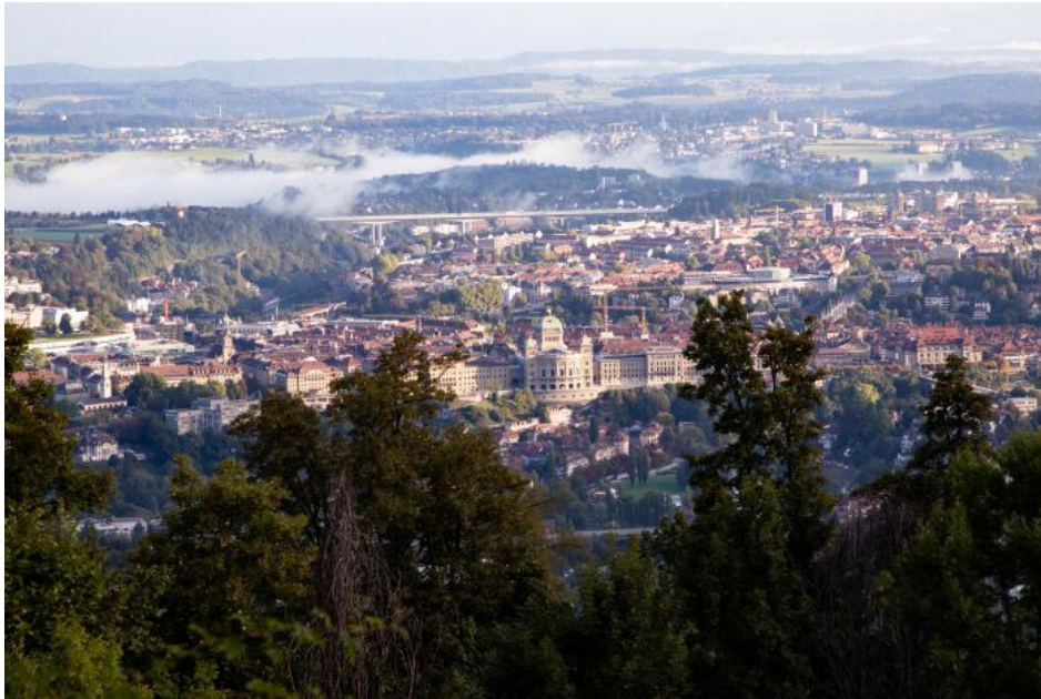
Not only valuable insights, but wonderful outsights too at the Gurten-Symposium.

Artificial intelligence shows promise that algorithms can learn to make decisions equivalent to those made by the humans from whose past decisions they learn. Of course, that is both the benefit and the risk. The other part of the archival future that permeated the symposium's discussions was the need to ensure that future archives are equitable and accessible to everyone. Artificial intelligence's ability to learn from past human behavior captured in training data makes it particularly vulnerable to perpetuating the biases we are fighting in other parts of our operations. Most of the speakers addressed the ethical challenges raised by AI, and the day concluded with a focus on the archival values that guide us.