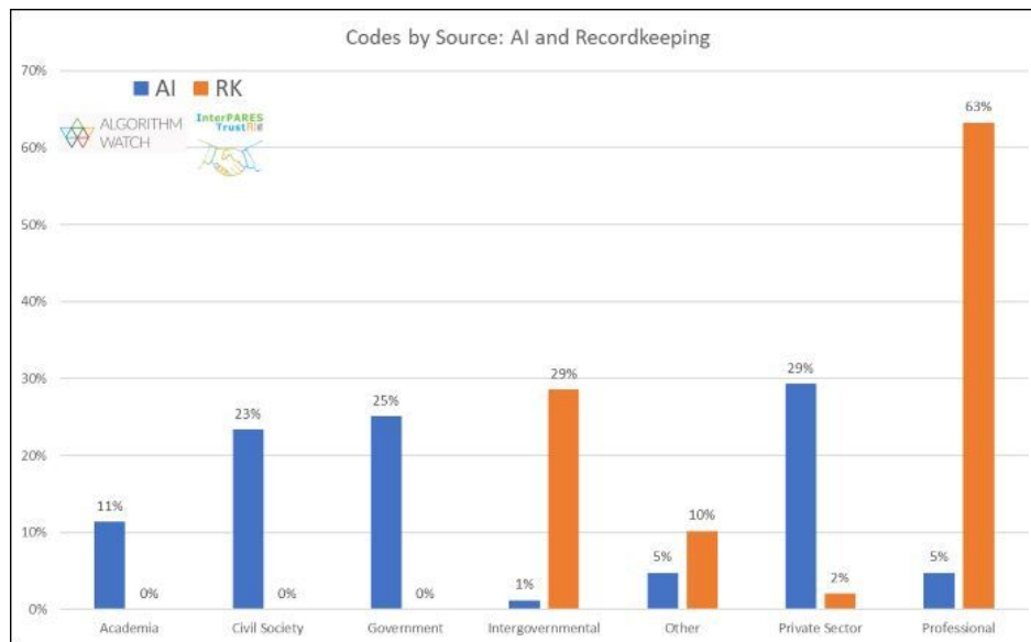
Codes by Source

Core archival values, such as the value of authentic records, will likely remain constant. For example, the accountability principle described by the IEEE's «Ethically Aligned Design» states: «Systems for registration and record-keeping should be established so that it is always possible to find out who is legally responsible for a particular A/IS [autonomous and intelligent systems].» But fulfilling such a requirement will be challenging when «it's not always clear when an AI system has been implemented in a given context, and for what task.»