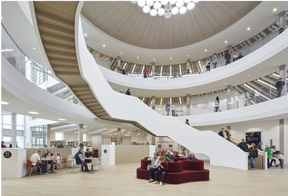
The Word, South Shields, UK.

All these questions are vital to ensuring that libraries have an enduring future. Traditional views of a library are hard to displace, yet the way we access information and the ways in which we communicate are changing fast. The 'model' for libraries has to change too, or we will keep on reinventing the past instead of working to meet the changing needs of society and the communities we serve. Designing Libraries plays a key role in that process by acting as a showcase illustrating how those changes are being planned and implemented.