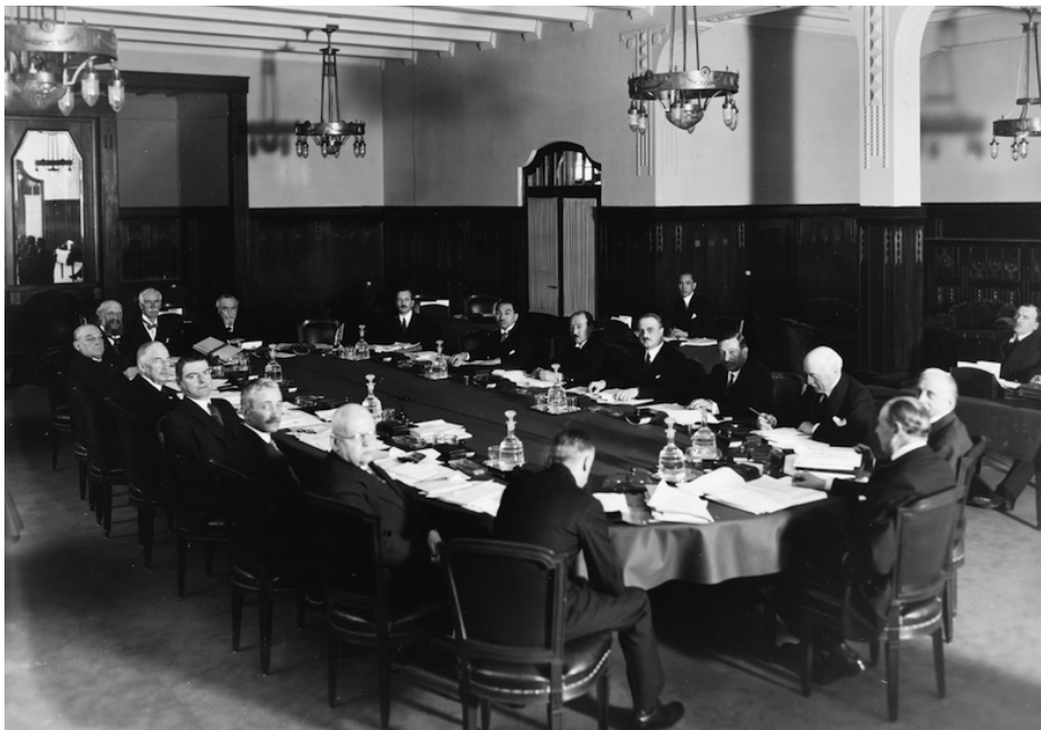
Bank International Settlement Unofficial First Bis Board Meeting April 1930

Currently, access to the BIS Archives is only on-site, meaning external researchers have the privilege of consulting original files. We are currently working on digitising selected files and making our most popular collections available remotely to enable access to our material for more researchers.